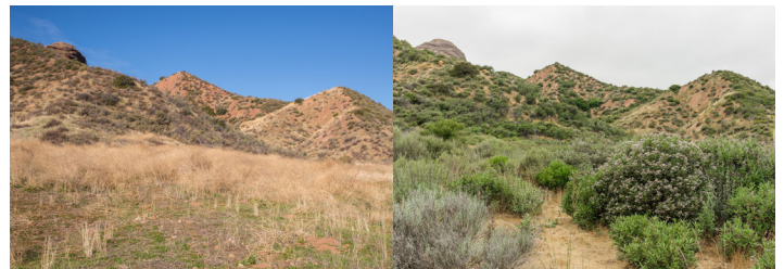
Before and after: San Francisquito Canyon.

A: Community engagement is at the heart of our work. We host around ten Mountain Forestry events per week, resulting in over 300 volunteer opportunities and the engagement of more than 3,000 volunteers annually for this department alone. Through education, training, and workshops, we empower individuals to become stewards of their local ecosystems. We also partner with TreePeople's award-winning education program to bring students and nature together.