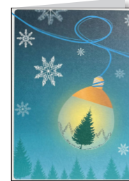
Card 3 - "Ornament"