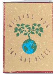
Card 1 - "Planet"

For more information visit: treepeople.org/tree-dedications