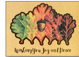
Card 4 - "Leaves"