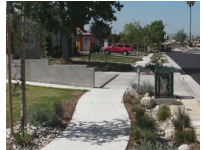
These before and after photos show some of the Northeast San Fernando Valley's neighborhood retrofit on Elmer Avenue. Improvements include curbs and gutters, parkway bioswales and native trees.